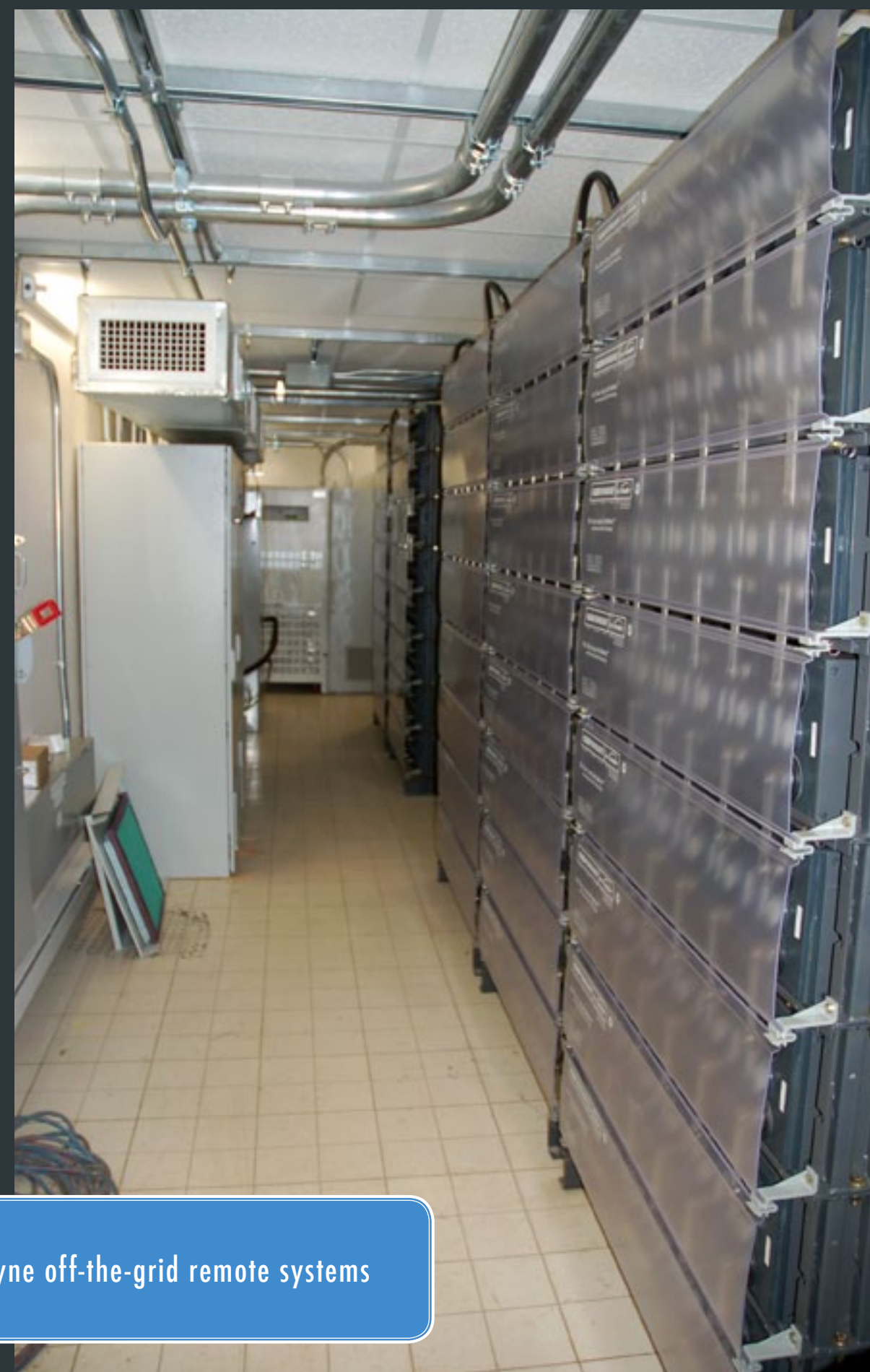
PortaDyne off-the-grid remote systems

One of Hybridyne’s projects, spawned the use of a lighting product, which was transferred to Hybridyne-RHS Inc. (RHS), which