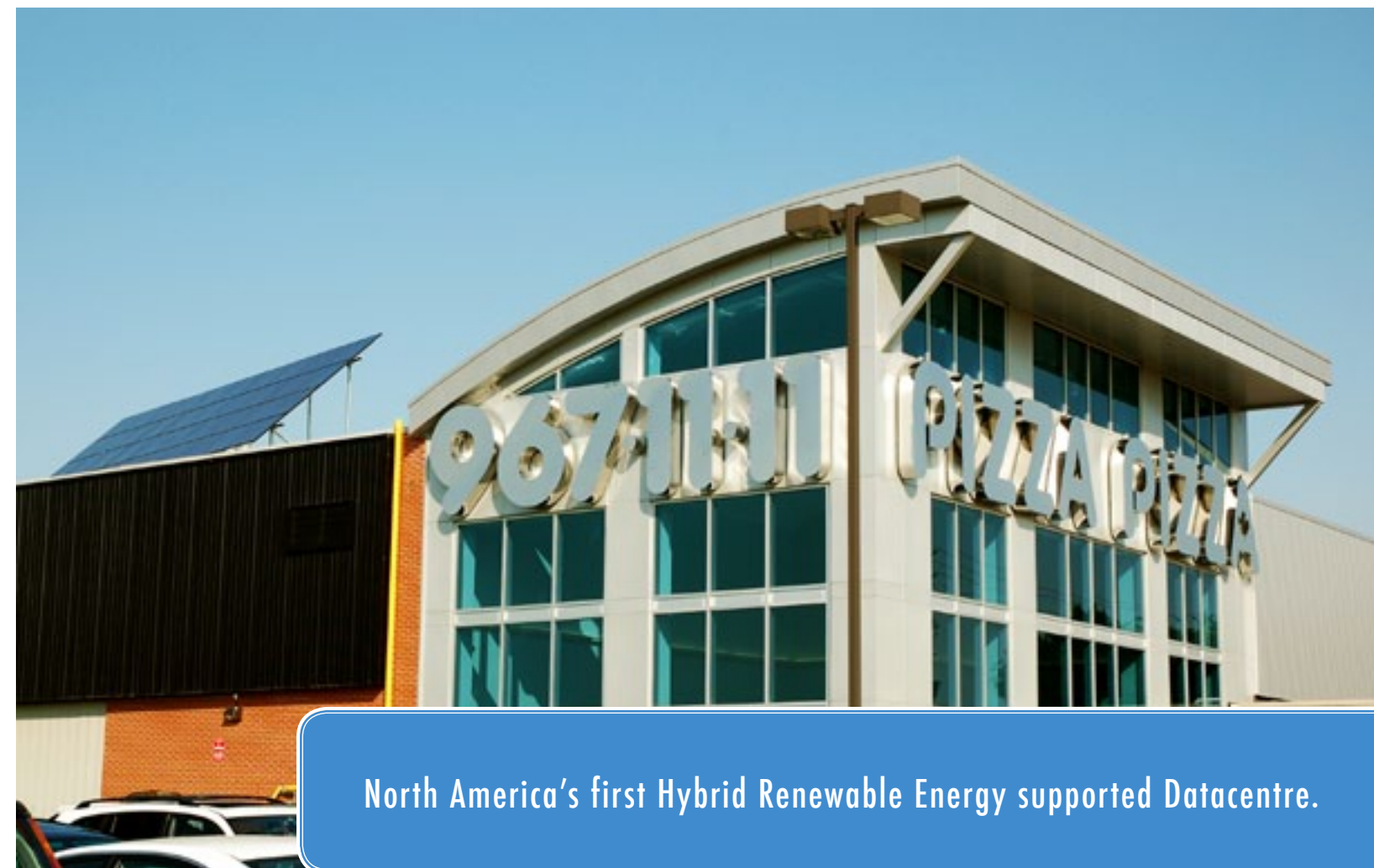
North America's first Hybrid Renewable Energy supported Datacentre.

years of experience in high availability electricity and power electronics, the pair realized at that particular meeting there was a potential opportunity to address the